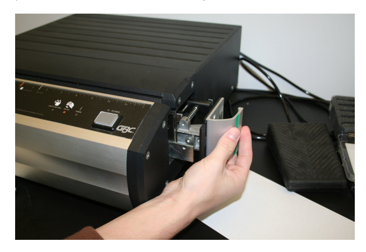
To remove pins, push down on the silver bar and rotate clockwise. Remove pins desired.